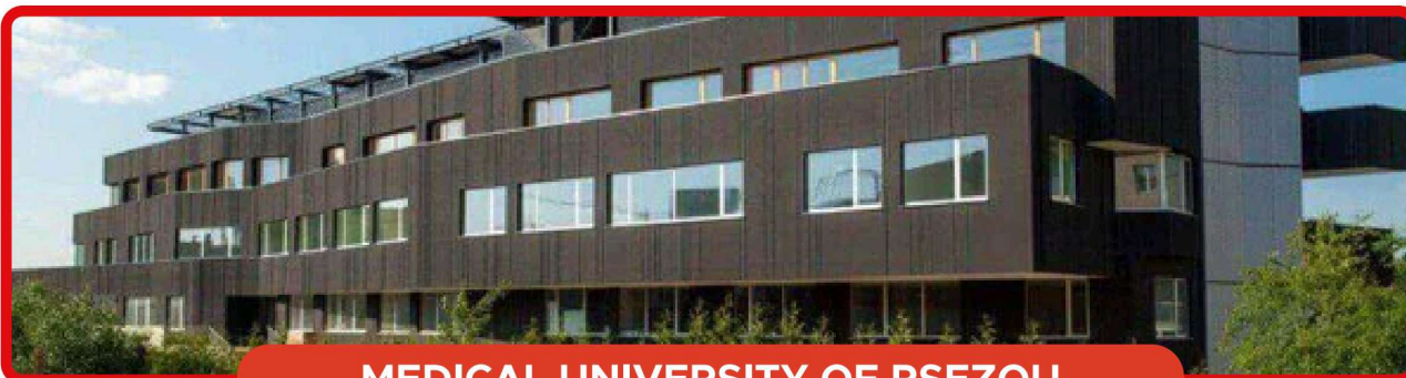
MEDICAL UNIVERSITY OF RZESZOU