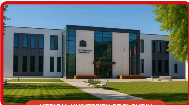
MEDICAL UNIVERSITY OF PLOVDIV