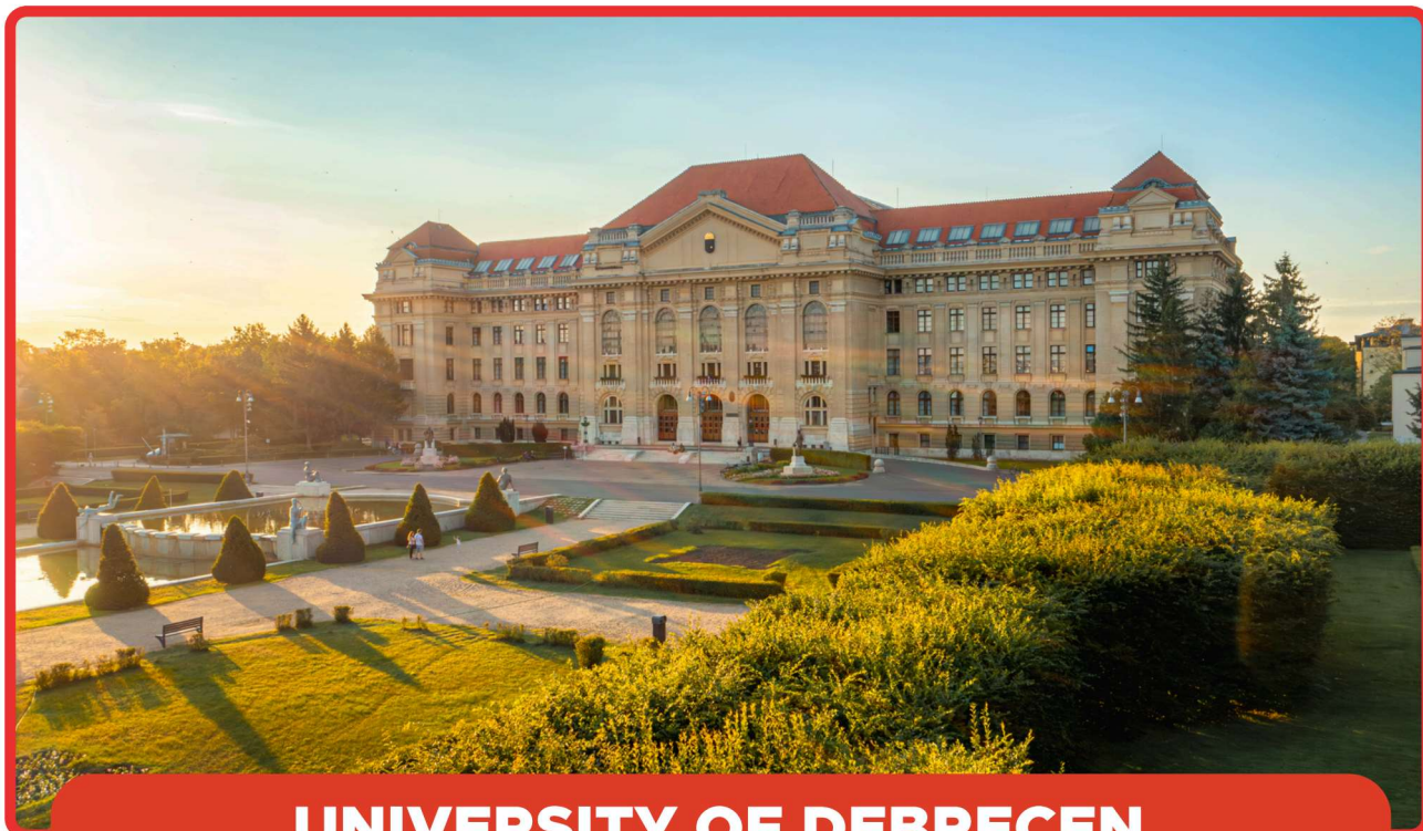
UNIVERSITY OF DEBRECEN