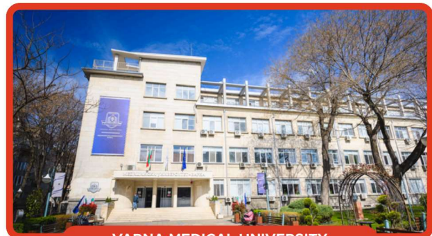
VARNA MEDICAL UNIVERSITY