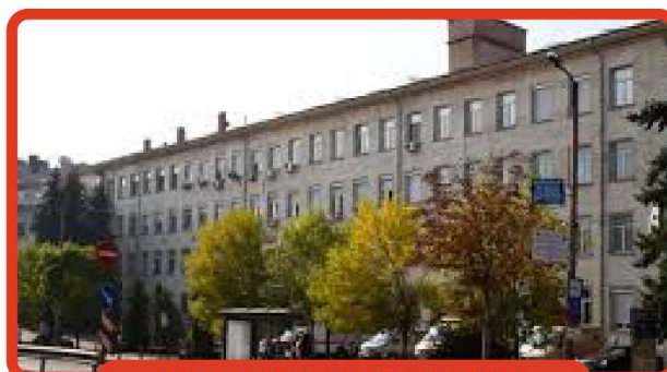
MEDICAL UNIVERSITY OF SOFIA