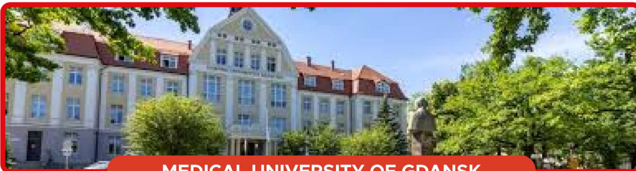
MEDICAL UNIVERSITY OF GDANSK