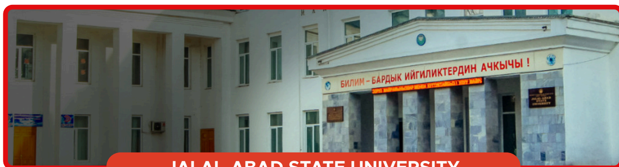
JALAL-ABAD STATE UNIVERSITY