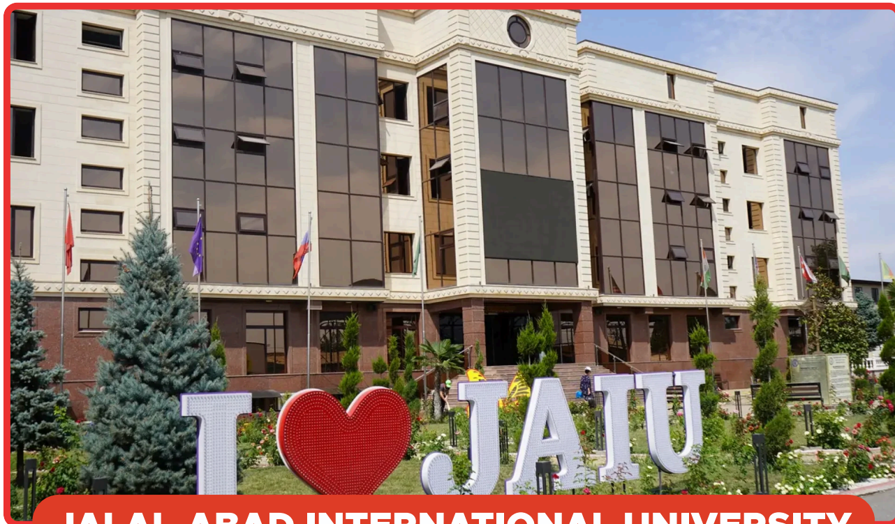
JALAL-ABAD INTERNATIONAL UNIVERSITY