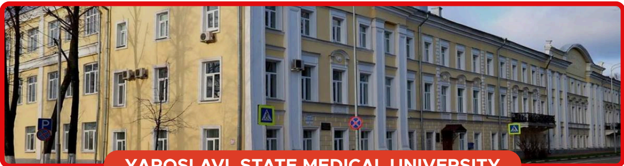
YAROSLAVL STATE MEDICAL UNIVERSITY