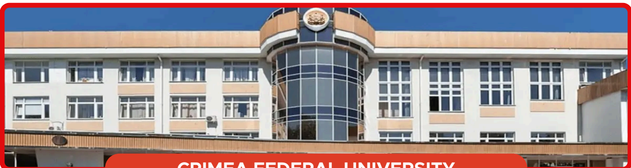
CRIMEA FEDERAL UNIVERSITY