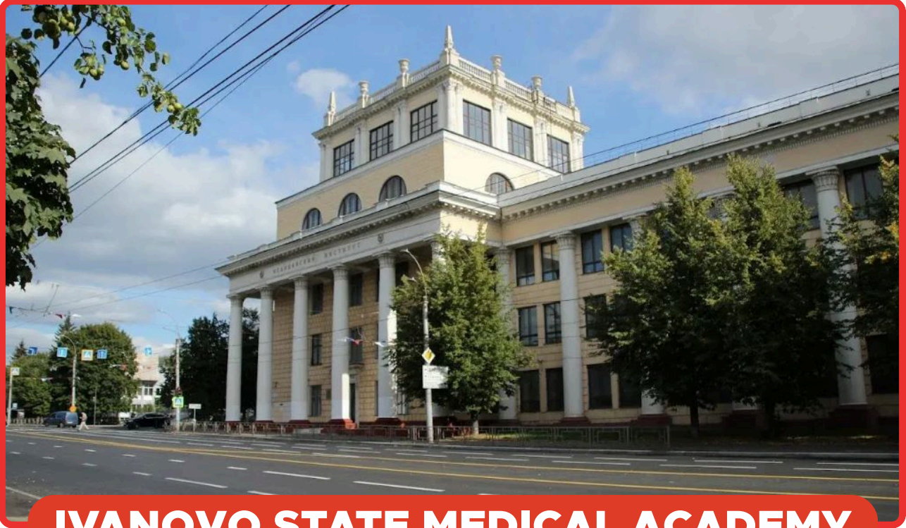
IVANOVO STATE MEDICAL ACADEMY