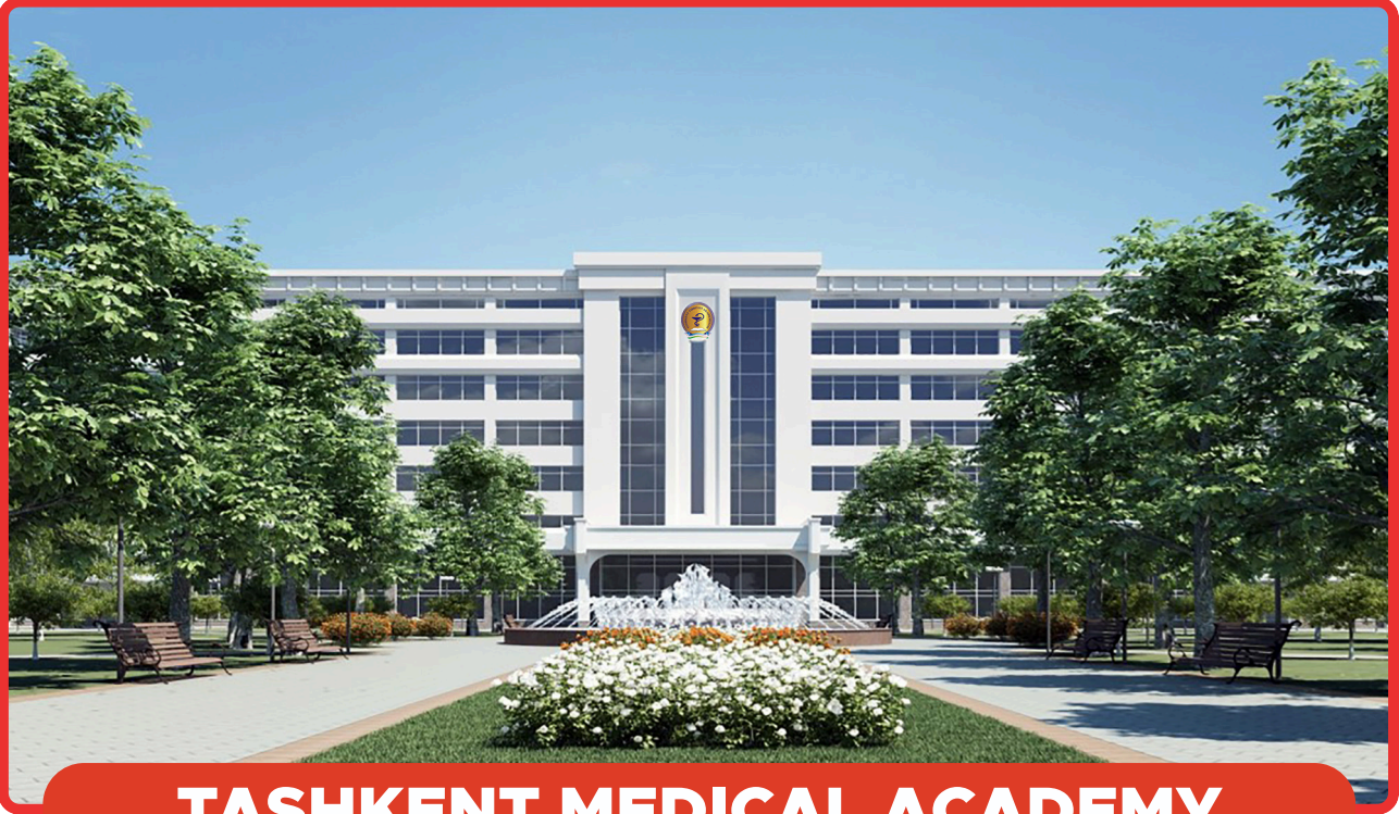
TASHKENT MEDICAL ACADEMY