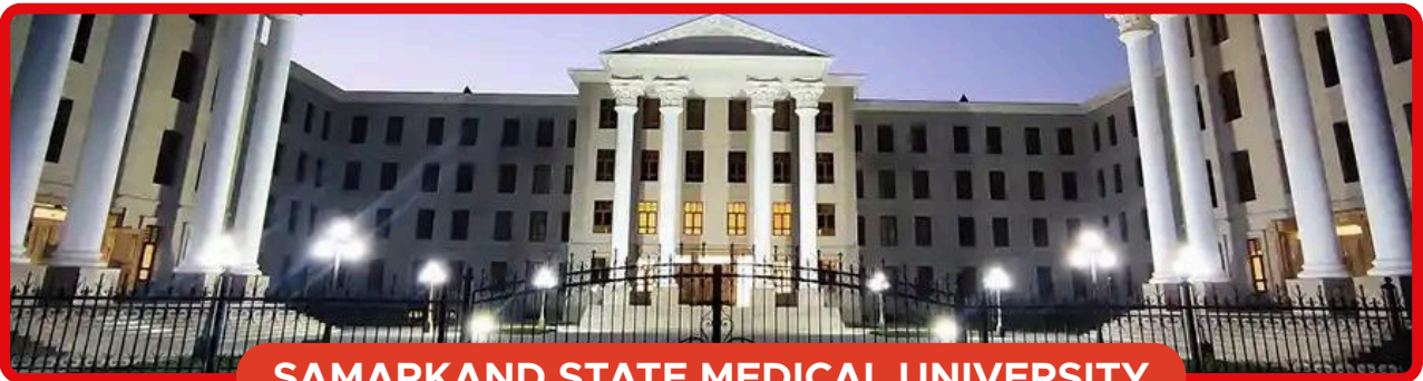
SAMARKAND STATE MEDICAL UNIVERSITY